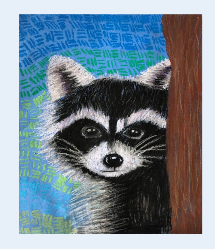
Indraja Sujith Grade 6